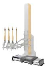
Synchronizing Axis YT05