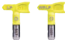
RAC X Low Pressure SwitchTips