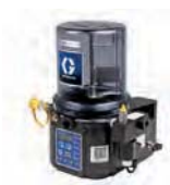
Grease Jockey with Telematics