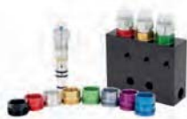
GCI Series Cartridge Injector