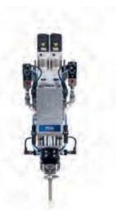
PR-Xv Variable Ratio Solution